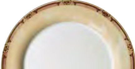
FULL DECOR WITH GOLD