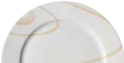
FULL DECOR ALL OVER