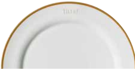
EDGE DECOR WITH VIGNETTE