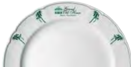
LINE WITH VIGNETTE

Restaurant Flemming in the clinical centre, Chemnitz