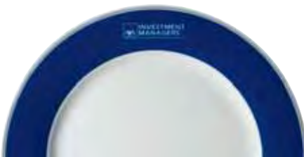
BAND WITH INTEGRATED LOGO