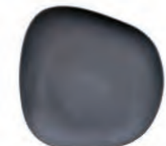
Yayoi Beltz, Superflat 26 x 24,5 x 4 cm Ref: 11026