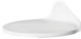
Mum D 21, H 6,5 cm Ref: 15004