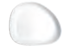
Yayoi Deep Glazed 19 x 16 x 4 cm Ref: 11003