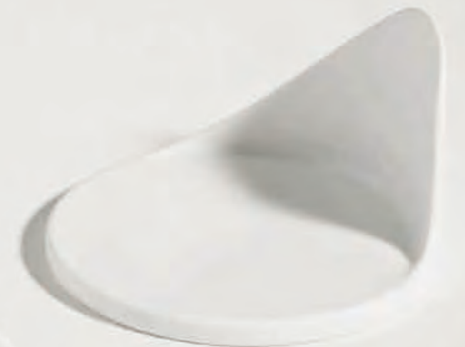
Gochi Girl, Ø 12,5 cm