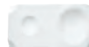
Jo Plate Matt 29 x 15 x 2 cm Ref. 20113