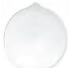
The Plate 22,2 x 25 x 2,3 cm Ref: 14007