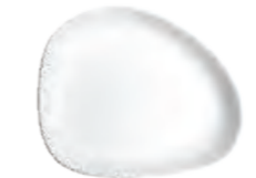
Yayoi Deep Matt 19 x 16 x 4 cm Ref: 11013