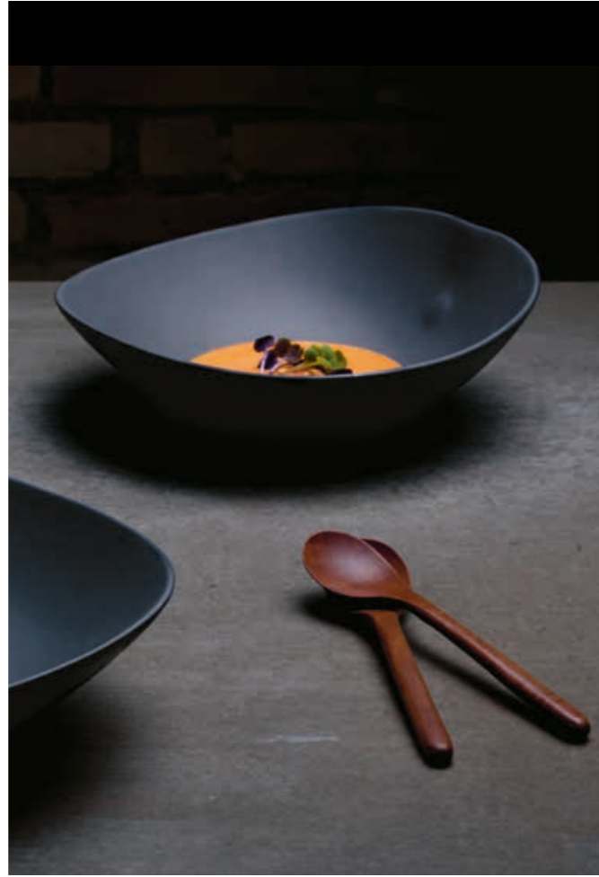
Shell Line Beltz, Salad Bowl

Textures of volcanic rock, basalt, magnesium and iron to give shape to the most emblematic pieces of the Shell Line collection designed by Ana roquero/