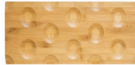
Jo 8 Bamboo 44 x 20 x 1 cm Ref. 20204