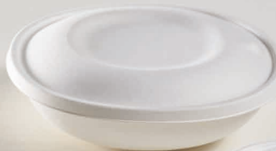
EKO Bowl 1000 ml