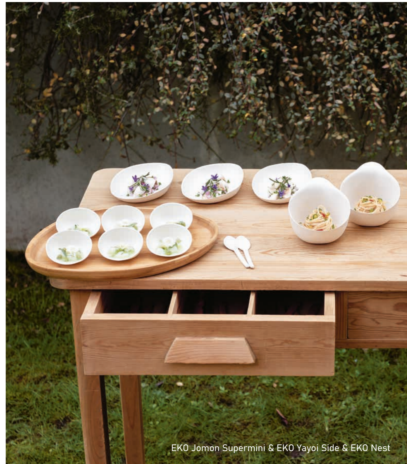
EKO Jomon Supermini & EKO Yayoi Side & EKO Nest

Pequeños rincones en el jardín se transforman en deliciosos caterings gracias a las piezas de CHIKIO, al poseer esa armonía y funcionalidad que nos hace disfrutar de los mejores momentos alrededor de una mesa