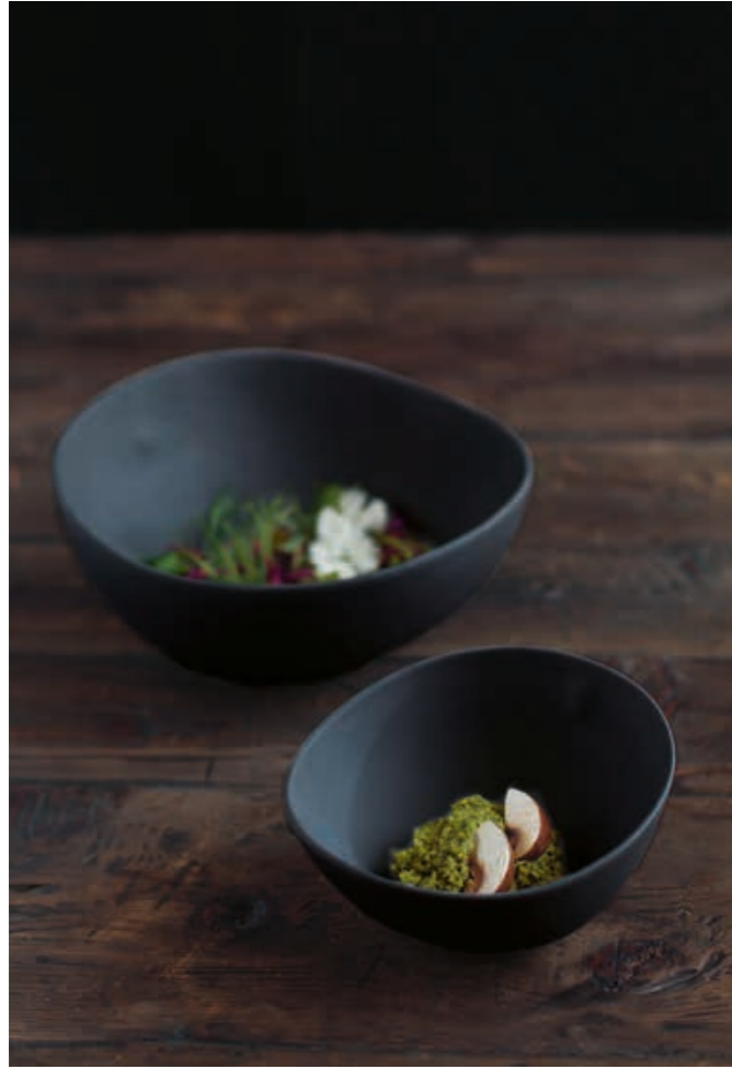
Shell Line Beltz, Ramen & Ice Cream Bowl

Textures of volcanic rock, basalt, magnesium and iron to give shape to the most emblematic pieces of the Shell Line collection designed by Ana roquero/