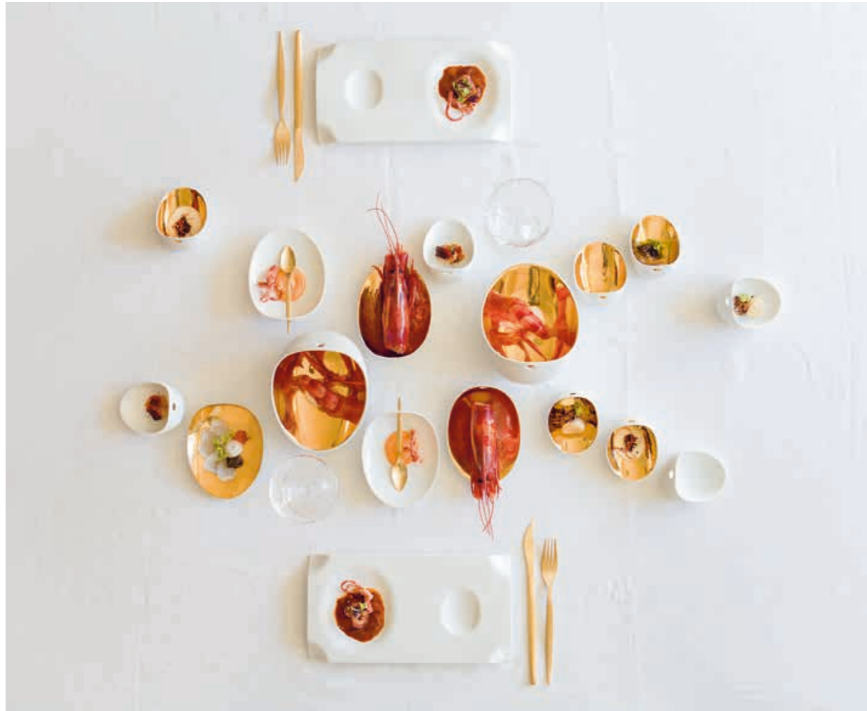
A set of trays with reliefs where the bowls can rest offer various dining possibilities and its aim is to be the support of the most divers gastronomy /