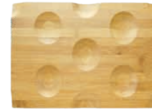
Jo 5 Bamboo 29 x 20 x 1 cm Ref. 20203