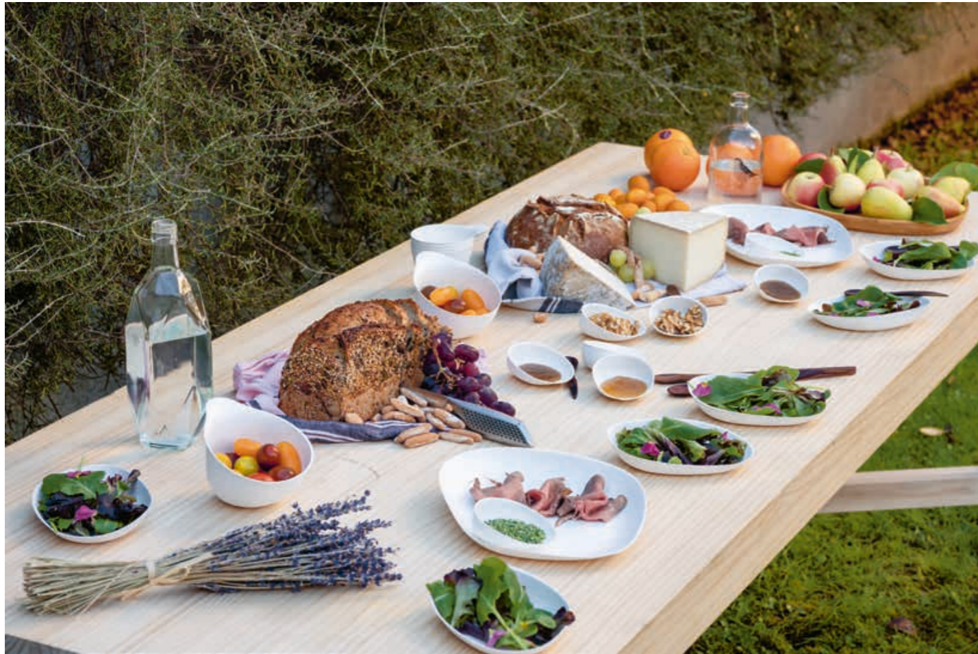
A refreshing and natural picnic in a table set up with CHIKIO pieces, where vibrant colours and succulent flavours meet, creating unforgettable meals in unique gardens/