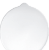
The Saucer 16 x 17,8 x 2,2 cm Ref: 14006