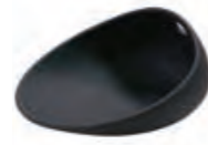
Jomon L Beltz 18 x 14 x 9 cm Ref. 10507