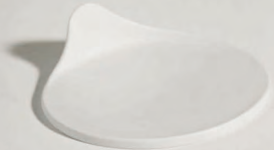
Gochi Mum, Ø 21 cm