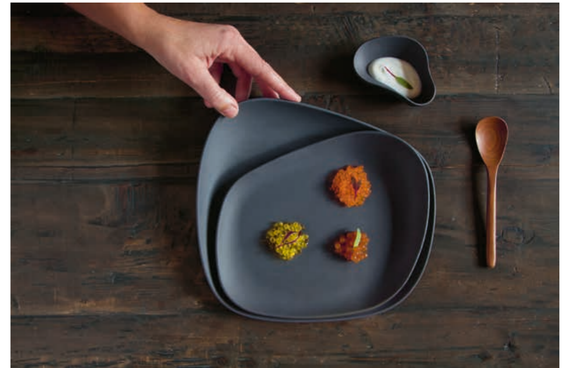
Yayoi Beltz Superflat and Flat