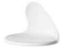
Dad D 15,5, H 10,5 cm Ref: 15003