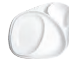
Yayoi Set Glazed 4 Plates Ref: 11005