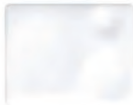
The Tablet 25 x 20 x 1,5 cm Ref: 14001