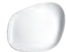
Yayoi Flat Glazed 23 x 20 x 3,5 cm Ref: 11004