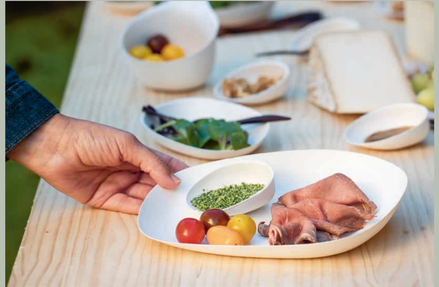
Una mesa con piezas de CHIKIO para compartir un picnic natural y refrescante se llena de vibrantes colores, sabrosos alimentos, comidas inolvidables en jardines únicos.