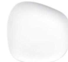
Yayoi Superflat Matt 26 x 24,5 x 4 cm Ref: 11016