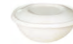
EKO Bowl 1400 ml 200 x 190 x 90 cm Ref: 30011