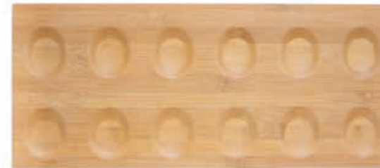
Jo 12 Bamboo 52 x 22 x 1 cm Ref. 20205