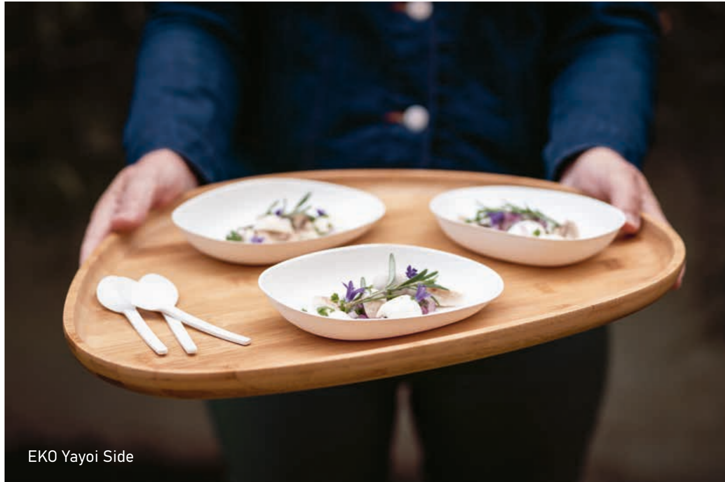
EKO Yayoi Side

Nothing is as natural and attractive as ergonomically well designed pieces, totally adaptable to the hand and with a highly sensitive perception. Like sculptures that desire to be much more than plain tableware/