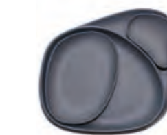
Yayoi Beltz, Set 4 Plates Ref: 11025