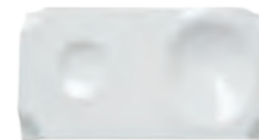
Jo Plate Glazed 29 x 15 x 2 cm Ref. 20103