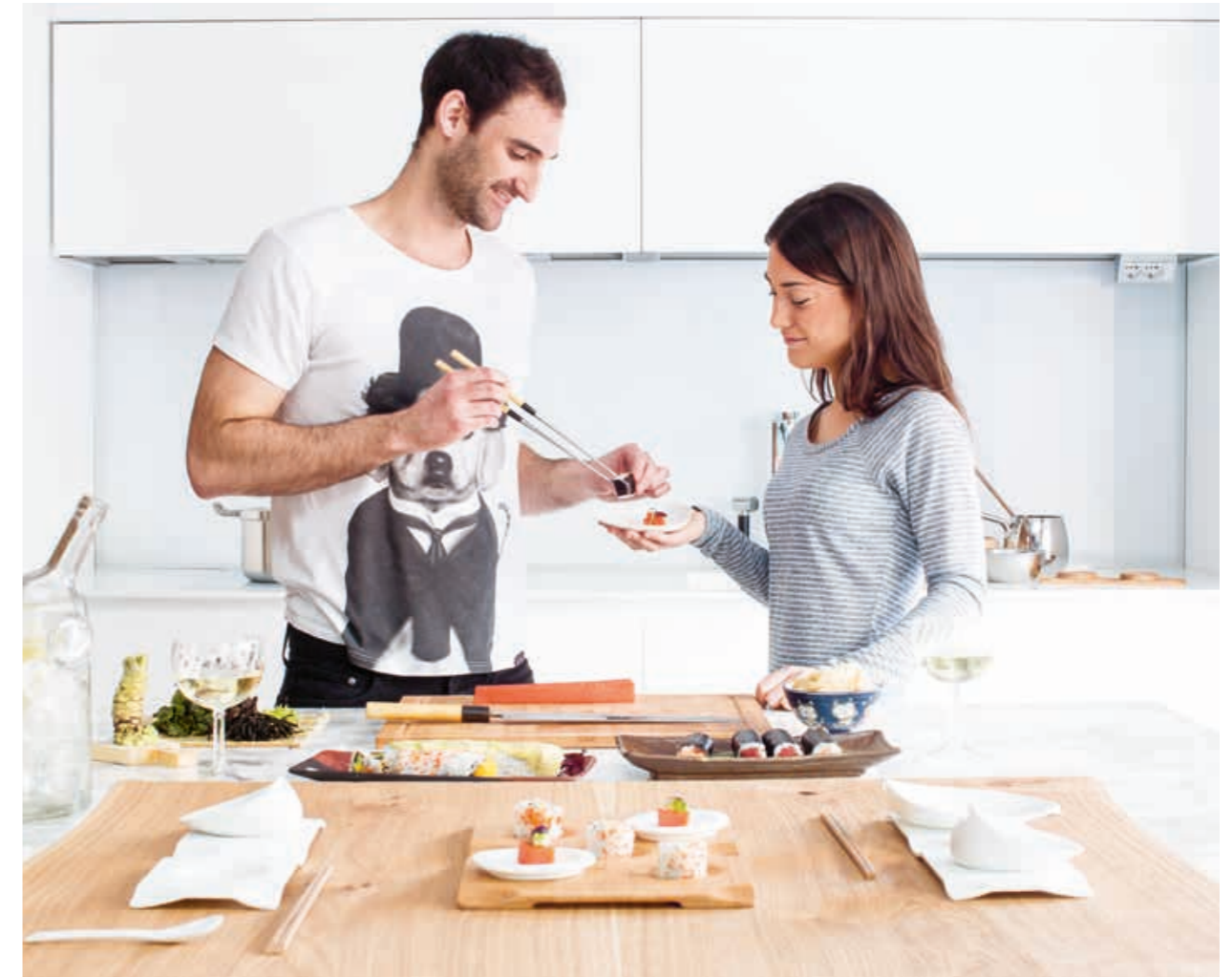
Un sistema de bandejas donde los cuencos descansan ofrecen un sinfín de posibilidades de presentación en la mesa. Su objetivo; ser el apoyo de la más diversa gastronomía.