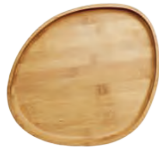
Yayoi Small Tray 31 x 29 x 2,5 cm Ref: 11201