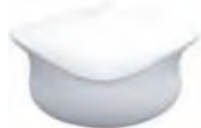
The Pot 15,5 x 14,5 x 9 cm Ref: 14002