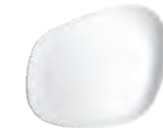
Yayoi Flat Matt 23 x 20 x 3,5 cm Ref: 11014