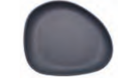
Yayoi Beltz, Deep 19 x 16 x 4 cm Ref: 11023