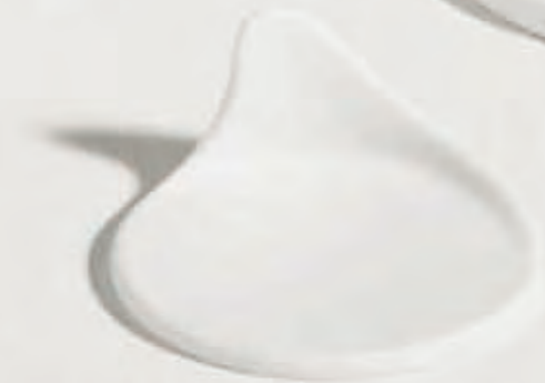
Gochi Baby, Ø 8 cm