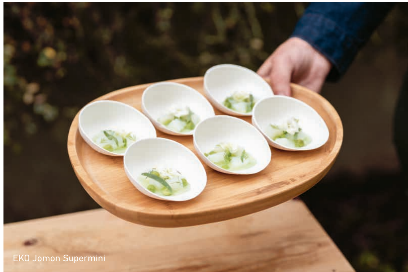
EKO Jomon Supermini

Small garden corners become tasteful caterings thanks to CHIKIO. Its harmony and functionality make each gathering a delightful experience/