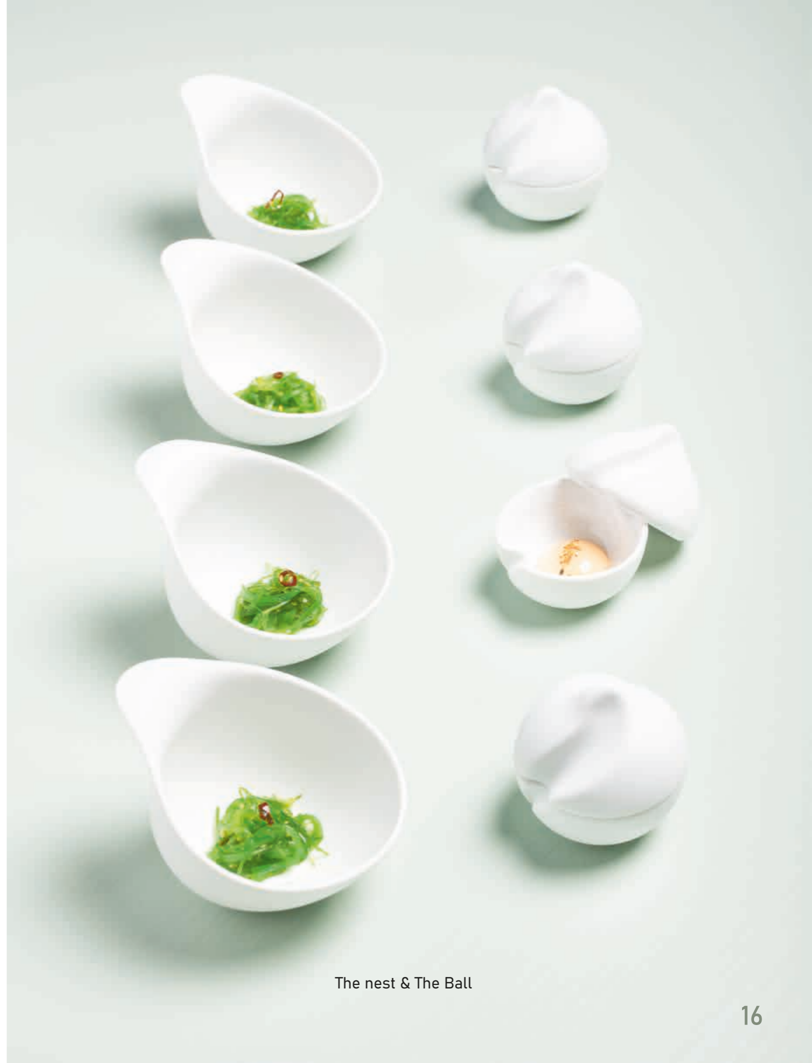
The nest & The Ball