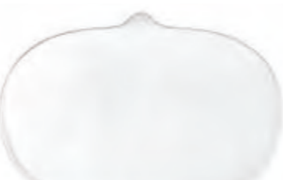
The Platter 35,5 x 23,5 x 2,2 cm Ref: 14008