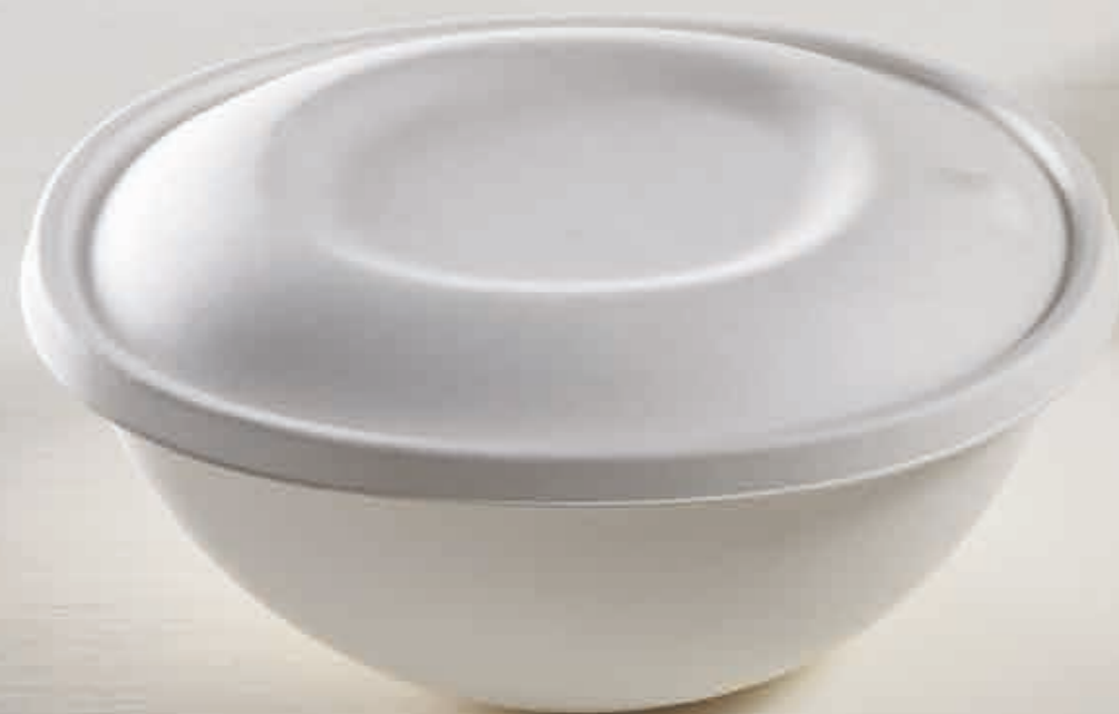
EKO Bowl 1400 ml