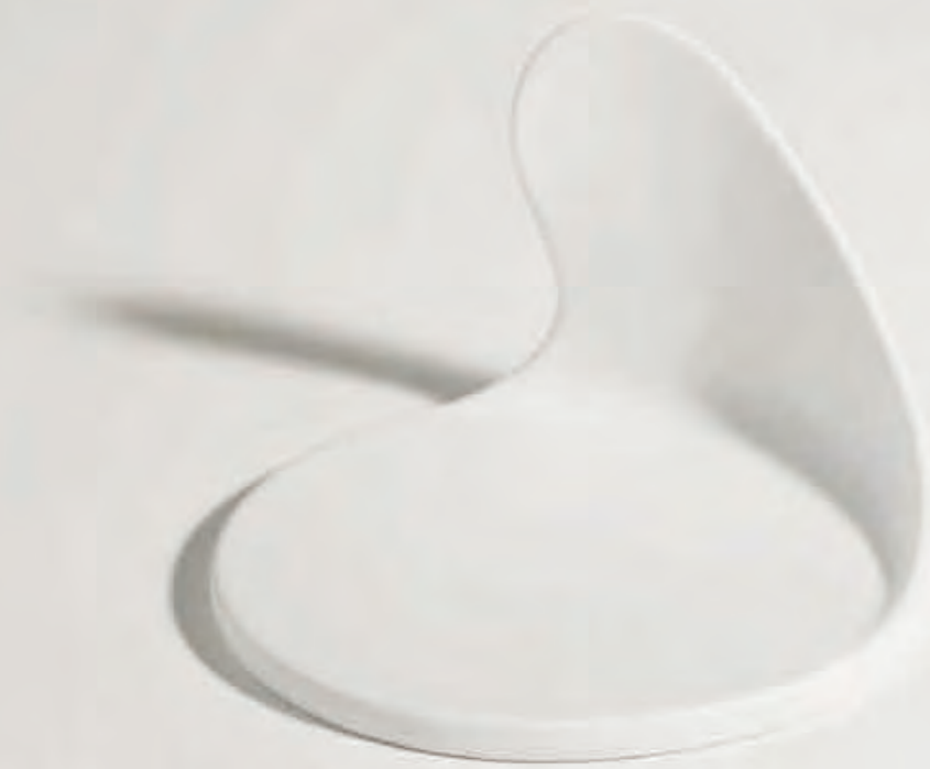
Gochi Dad, Ø 15,5 cm