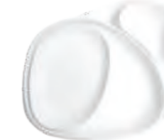
Yayoi Set Matt 4 Plates Ref: 11015