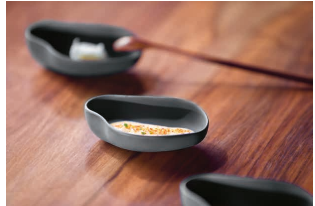
Yayoi Beltz Appetizer