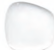
Yayoi Superflat Glazed 26 x 24,5 x 4 cm Ref: 11006