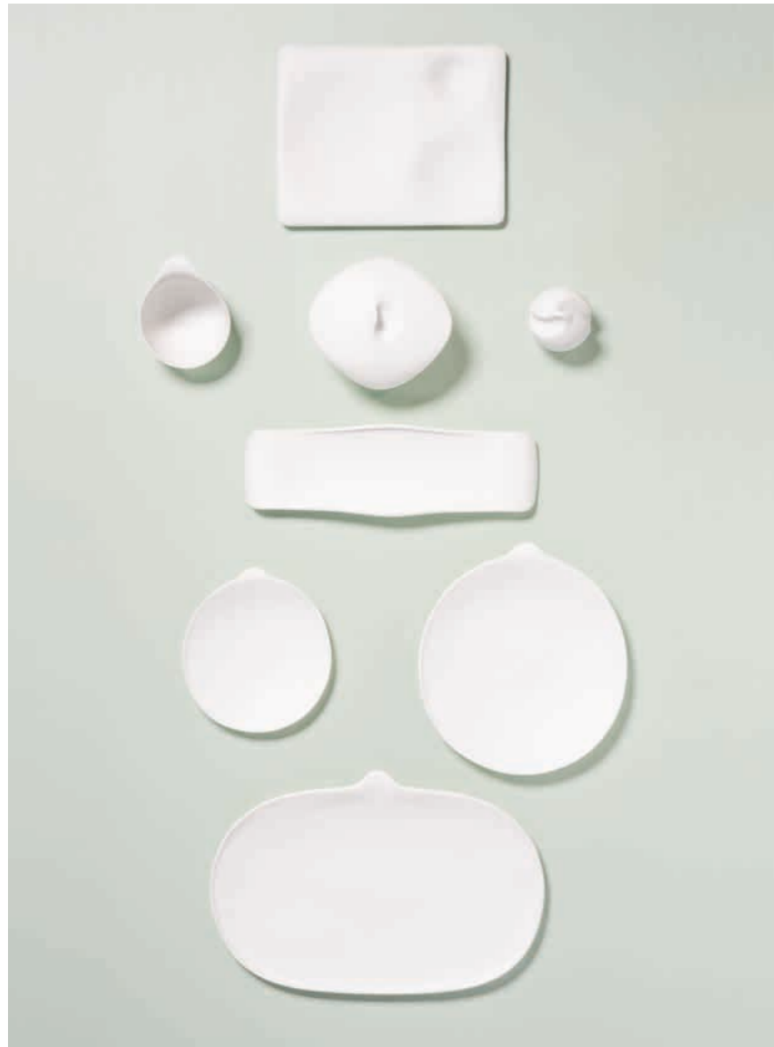
The Tablet: Whole range

The new collection The Tablet is the outcome of an in-depth analysis with the aim to design a set for every kind of meal around the world /