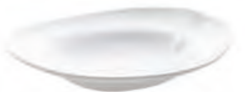
Deep plate Glazed 25 x 26 x 6 cm Ref: 12002