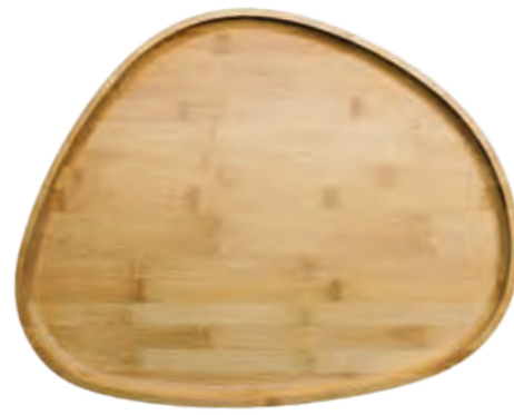
Yayoi Big Tray 43 x 36 x 2,5 cm Ref: 11202