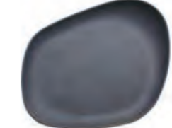
Yayoi Beltz, Flat 23 x 20 x 3,5 cm Ref: 11024