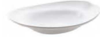
Deep plate Matt 25 x 26 x 6 cm Ref: 12012